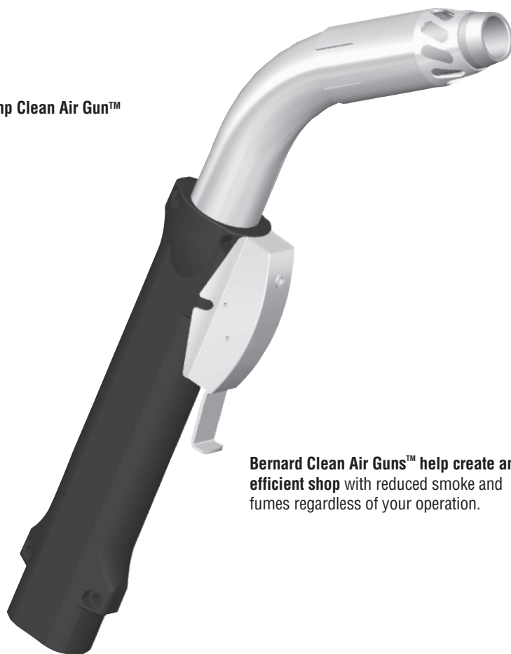
400 Amp Clean Air Gun™

Bernard Clean Air Guns™ help create an efficient shop with reduced smoke and fumes regardless of your operation.